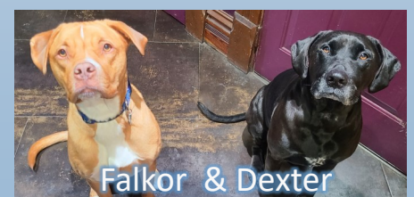
Falkor & Dexter