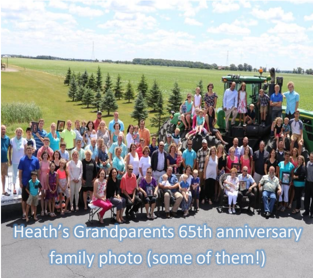
Heath's Grandparents 65th anniversary family photo (some of them!)