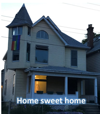
Home sweet home