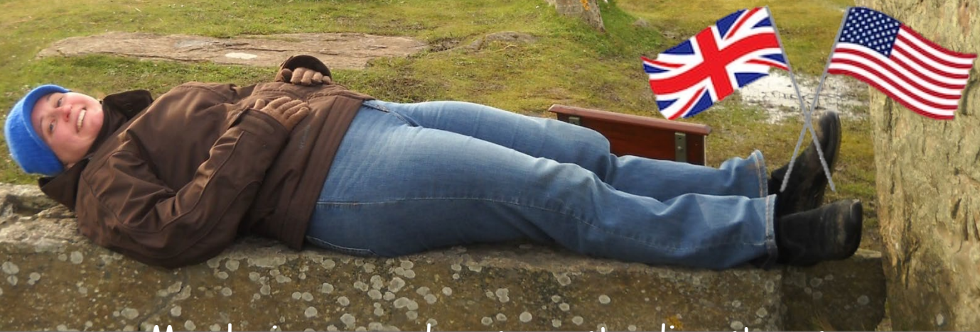
Me playing around on some standing stones in the Orkney Islands, Scotland

I have been blessed with an amazing career (university professor) that has shown me the world—a gift I want to share with my child. I am a citizen of two countries (the US and UK), and I work on projects around the globe including US, Europe and Australia. I was a Peace Corps Volunteer in West Africa, and up until 2 years ago I lived in Dundee, Scotland. Thus, in addition to being loved by me, my child would also have “aunts”, “uncles”, and “cousins” in the UK, France, Germany, Netherlands, and Australia.