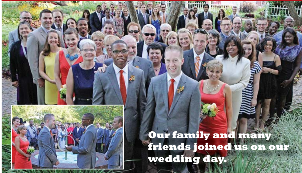
Our family and many friends joined us on our wedding day.