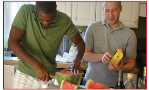
Cooking is one love we have in common (eating too).

invited to spend quality time with you before your child is born and we commit to invite you to share in the life of our family.