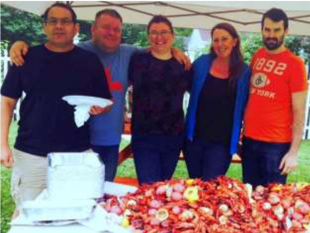
Friends and family eating crawfish, yum!