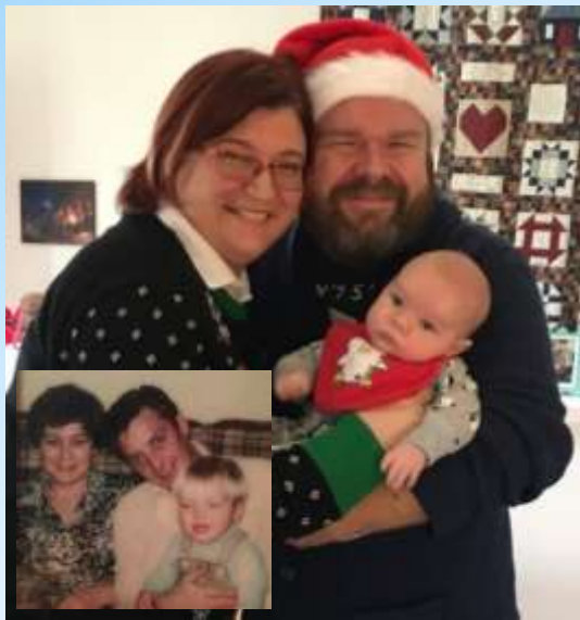
First day at home, 1978 (inset) & 2017