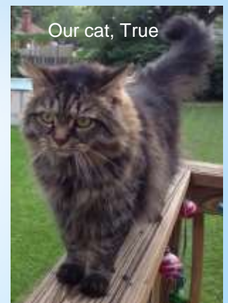
Our cat, True

Family traditions are important to us, particularly celebrating our holidays with good food and good times. The kitchen overflows with food from the deep fried Thanksgiving turkeys and family-recipe sage dressing, Mardi Gras crawfish, Christmas Eve ribs, and New Year's crab boil. We enjoy sharing our love of decorating during Christmas with the music playing and cookies baking in the oven, coloring Easter eggs, Halloween costumes, walking over to the park for 4 th of July fireworks, and fun brass band music for Mardi Gras season while eating King Cake.