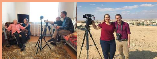
Producing videos in Siberia (left) and Israel (right).

We rescued our dog Benjy – a beagle mix – a few months after arriving in Ohio. He's about 4 years old, and he's our partner in crime. Benjy is sweet and gentle , and he loves to run outside and chase squirrels in our backyard!