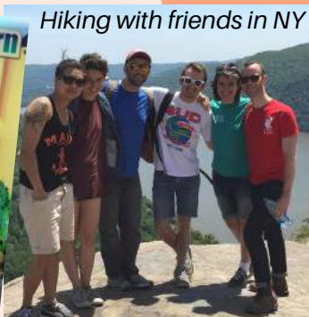
Hiking with friends in NY