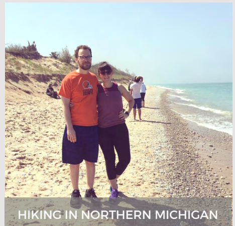
HIKING IN NORTHERN MICHIGAN