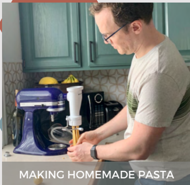
MAKING HOMEMADE PASTA