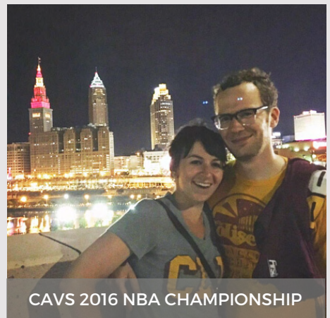
CAVS 2016 NBA CHAMPIONSHIP