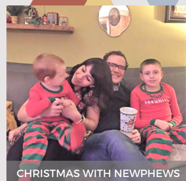
CHRISTMAS WITH NEPHEWS

Our promise is that a child placed in our home will grow and thrive. They will experience the wonders of the world through travel and play. They will be in a home full of comfort, coziness, and unconditional love. They will be raised to be kind and just and we will empower them to raise their voice to stand up for what's right. It is our goal to raise a good human and a good citizen. A child placed in our home will know just how special they are, and how special you are. We can't wait to start our journey with you!