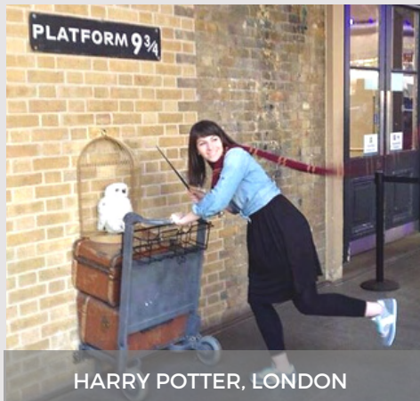
HARRY POTTER, LONDON