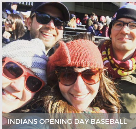
INDIANS OPENING DAY BASEBALL