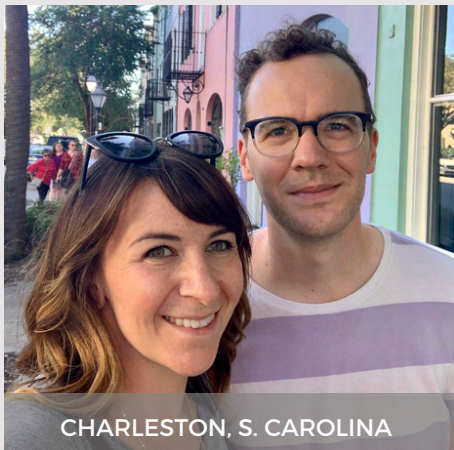
CHARLESTON, S. CAROLINA