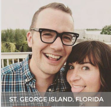
ST. GEORGE ISLAND, FLORIDA