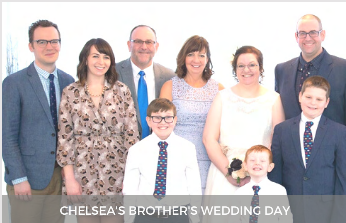
CHELSEA'S BROTHER'S WEDDING DAY