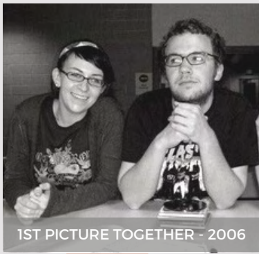
1ST PICTURE TOGETHER - 2006