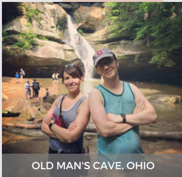
OLD MAN'S CAVE, OHIO