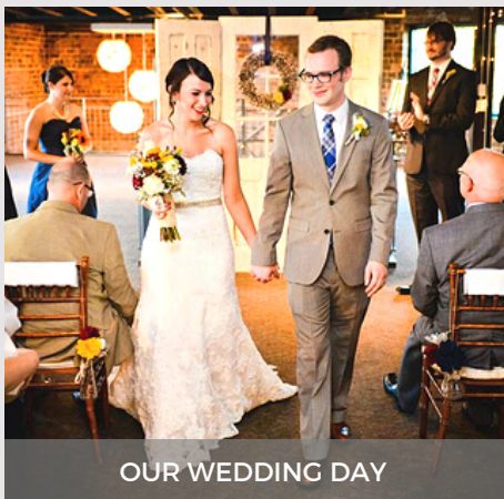
OUR WEDDING DAY