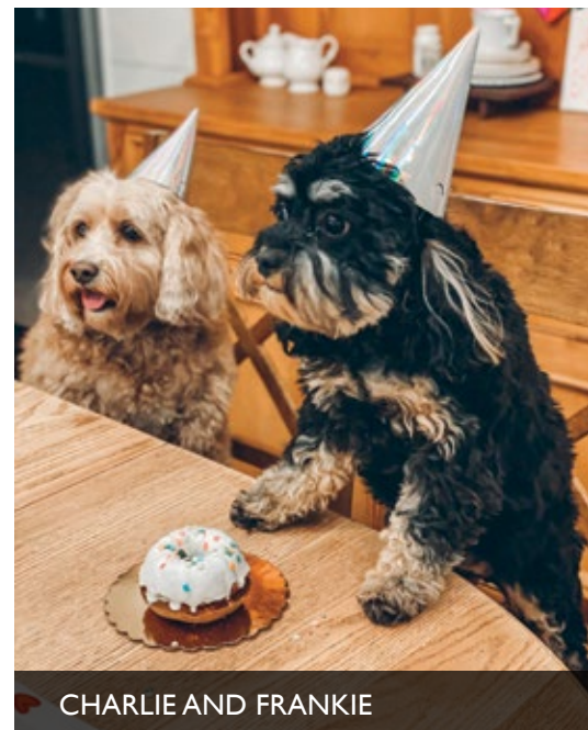
CHARLIE AND FRANKIE