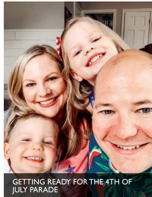
GETTING READY FOR THE 4TH OF JULY PARADE