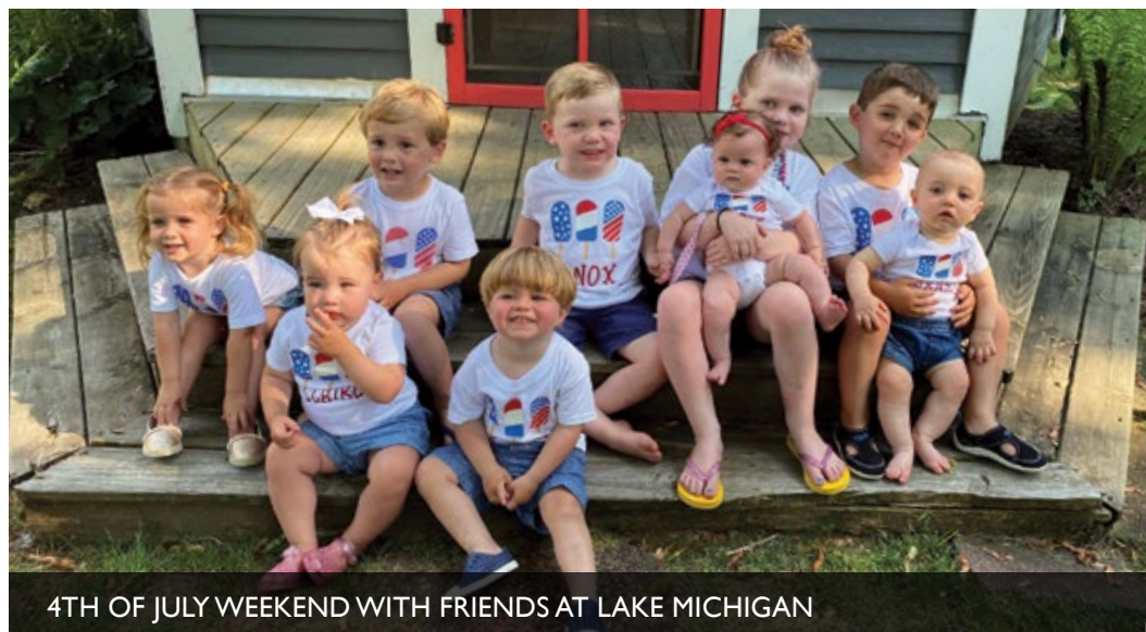
4TH OF JULY WEEKEND WITH FRIENDS AT LAKE MICHIGAN