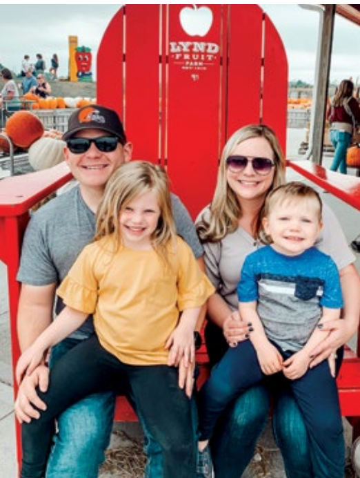
FALL FRUIT FARM FUN