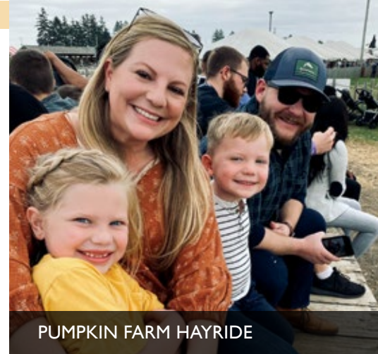
PUMPKIN FARM HAYRIDE

Charlie is a 10-year-old cockapoo and Frankie is a 1.5-year-old cavapoo. They are sweet dogs and love being around kids.