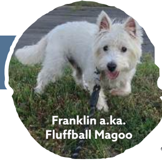
Franklin a.k.a. Fluffball Magoo

Franklin is the sweetest, snuggliest, most spirited boy. He is incredible with children. He will be an amazing companion and best friend to any child in our lives.