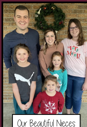
Our Beautiful Nieces