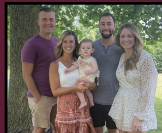
Our Goddaughter's First Birthday