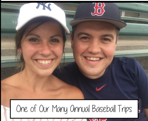
One of Our Many Annual Baseball Trips

We promise that in our home, your child's life will be filled with laughter and adventure. We will provide opportunities to help them discover what they are passionate about and develop their strengths, skills, and interests. We will teach them to love themselves and others and to understand the love of Jesus Christ. We will also surround them with friends, family, and a community that provides support, love, and commitment. We will be open and honest about their story and help them find answers and process through questions they have.