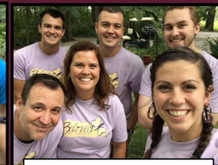
Volunteering at a Local Fundraiser