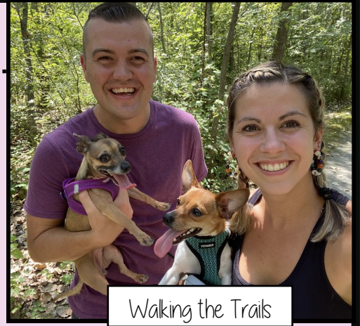
Walking the Trails

We live in a three bedroom home that is filled with natural light, plants, and bohemian décor. It has an open layout that makes it great for hosting game nights, watch parties, dinner parties, and slumber parties with our nieces. We have a spacious backyard with outdoor seating and a firepit perfect for summer barbecues. Our house is within a mile of everything from the police and fire departments to a local hospital and a grocery store. We're also within walking distance to a park and trails that are perfect for biking, walking the dogs, or kayaking. We live two blocks from an elementary school, and there are always kids playing outside in our neighborhood. Our friend from church will be our nanny during the school year, and her house is a short walk to a splash pad, huge playground, and a beach on a lake.