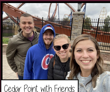
Cedar Point with Friends