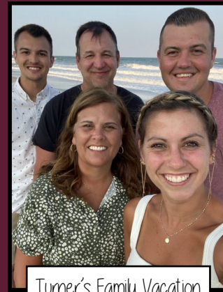
Turner's Family Vacation