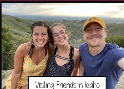
Visiting Friends in Idaho