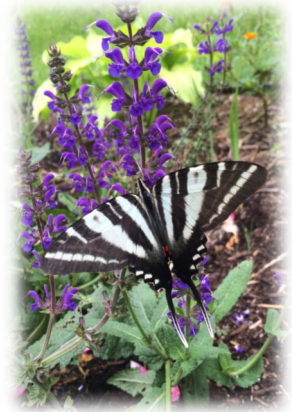
Butterfly in our garden

We will give your child many opportunities to discover their passions and interests , exposing them to various sports and the arts. Both of us grew up taking family trips , including swim-