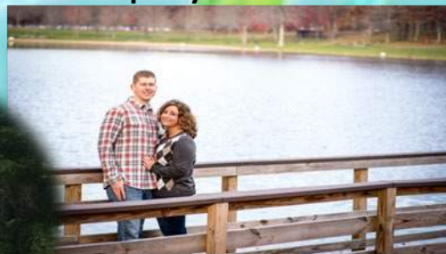
About our Family/Traditions