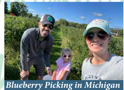
Blueberry Picking in Michigan