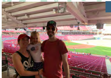
Cheering for our local baseball team