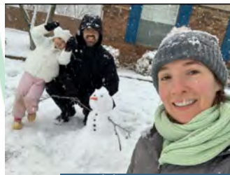
Building a Snowman