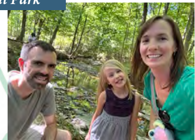
Hiking at a Local Park