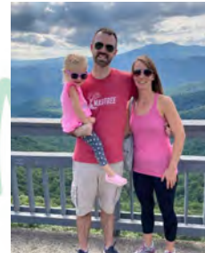
Blue Ridge Mountains