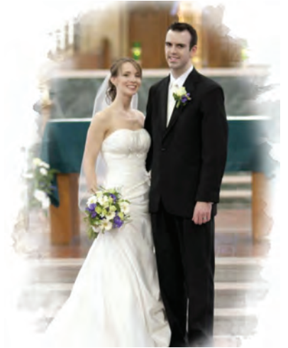
Our wedding day