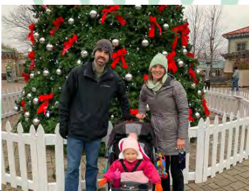
Festival of Lights at Zoo