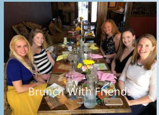
Brunch With Friends