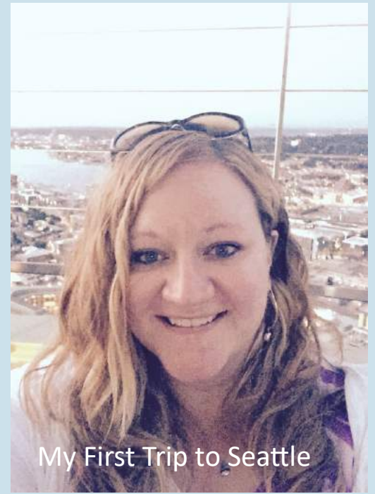
My First Trip to Seattle

I have been lucky enough to travel around the country to many cities including San Diego, New York, Seattle, Los Angeles, Las Vegas, San Antonio, Saint Augustine, Myrtle Beach, and abroad to Greece and Turkey. I want to be able to show my child everything that I have seen. But more importantly, I want to be able to raise them to have the confidence to be able to explore and experience life on their terms.