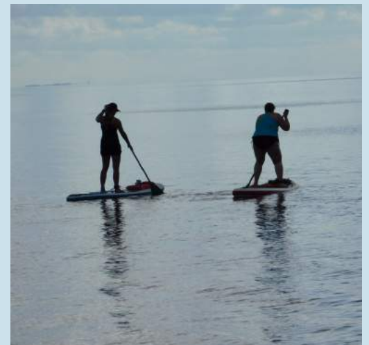
Trying new things!