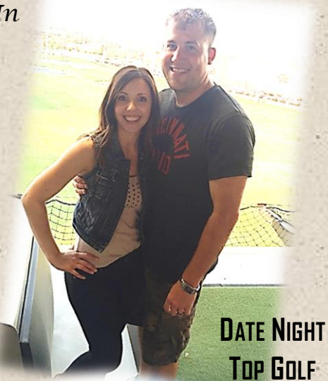
DATE NIGHT TOP GOLF

Thank You! We have been blessed in so many ways and we hope we will soon be blessed with another child to love, cherish, and parent as our own. You've traveled a long road to make it to this decision. Whatever family you choose to parent your child, may God bless you on your journey and give you peace and comfort with your decision.