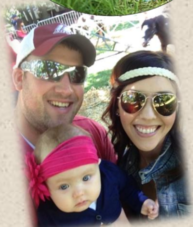
4 TH OF JULY FESTIVAL