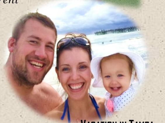
VACATION IN TAMPA