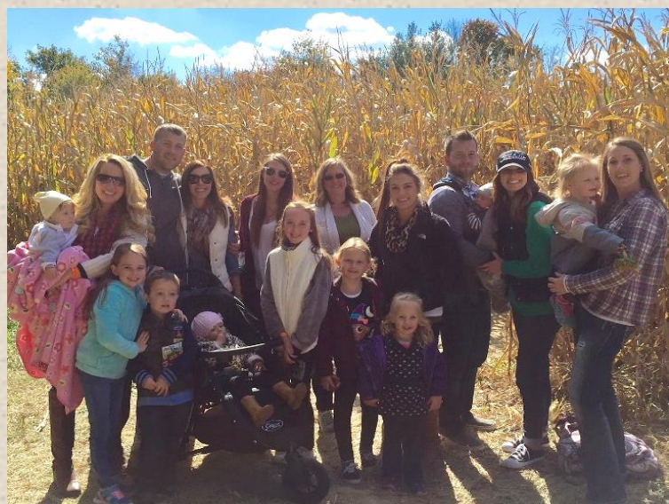
CORN MAZE & PUMPKIN PATCH WITH FAMILY