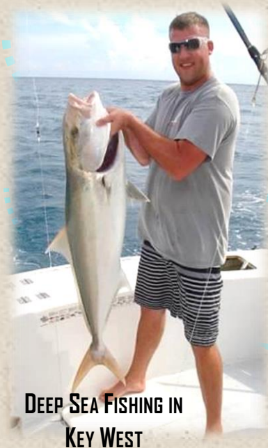
DEEP SEA FISHING IN KEY WEST