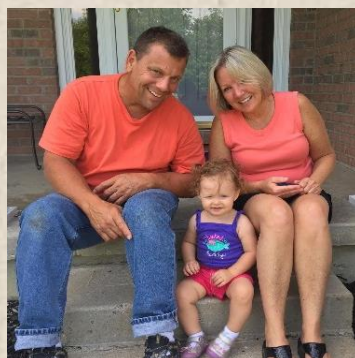
QUALITY TIME WITH GRANDPARENTS