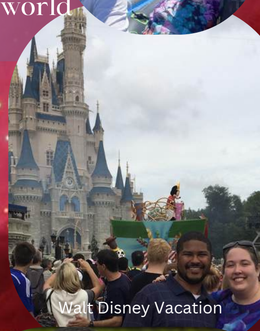
Walt Disney Vacation