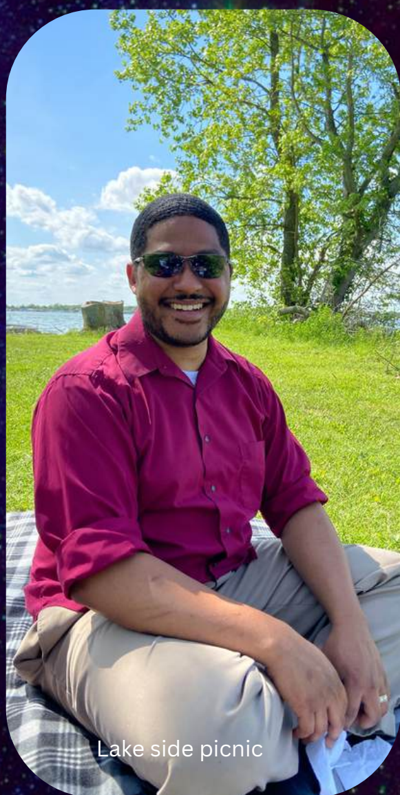
Lake side picnic