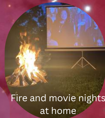
Fire and movie nights at home

We both have close families. For the past seventeen years of our relationship (over ten years of marriage) we have attended hundreds of family gatherings to include holidays, weddings, graduations, recitals, ball games, and family vacations. The two of us look forward to sharing these celebratory moments with a little one, and eventually a second. Beyond the family network, we both have developed a network of close dependable friends. Whether we met at university, through work, or while out in the community, these individuals have chosen to be a part of our family and we could not be more grateful. A child placed in our home will experience a diverse network of people with a genuine desire to make the world a better place one act at a time. That child will learn how our collective experiences can work together to strengthen our impact on the world around us in the most positive and loving way.