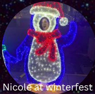
Nicole at winterfest