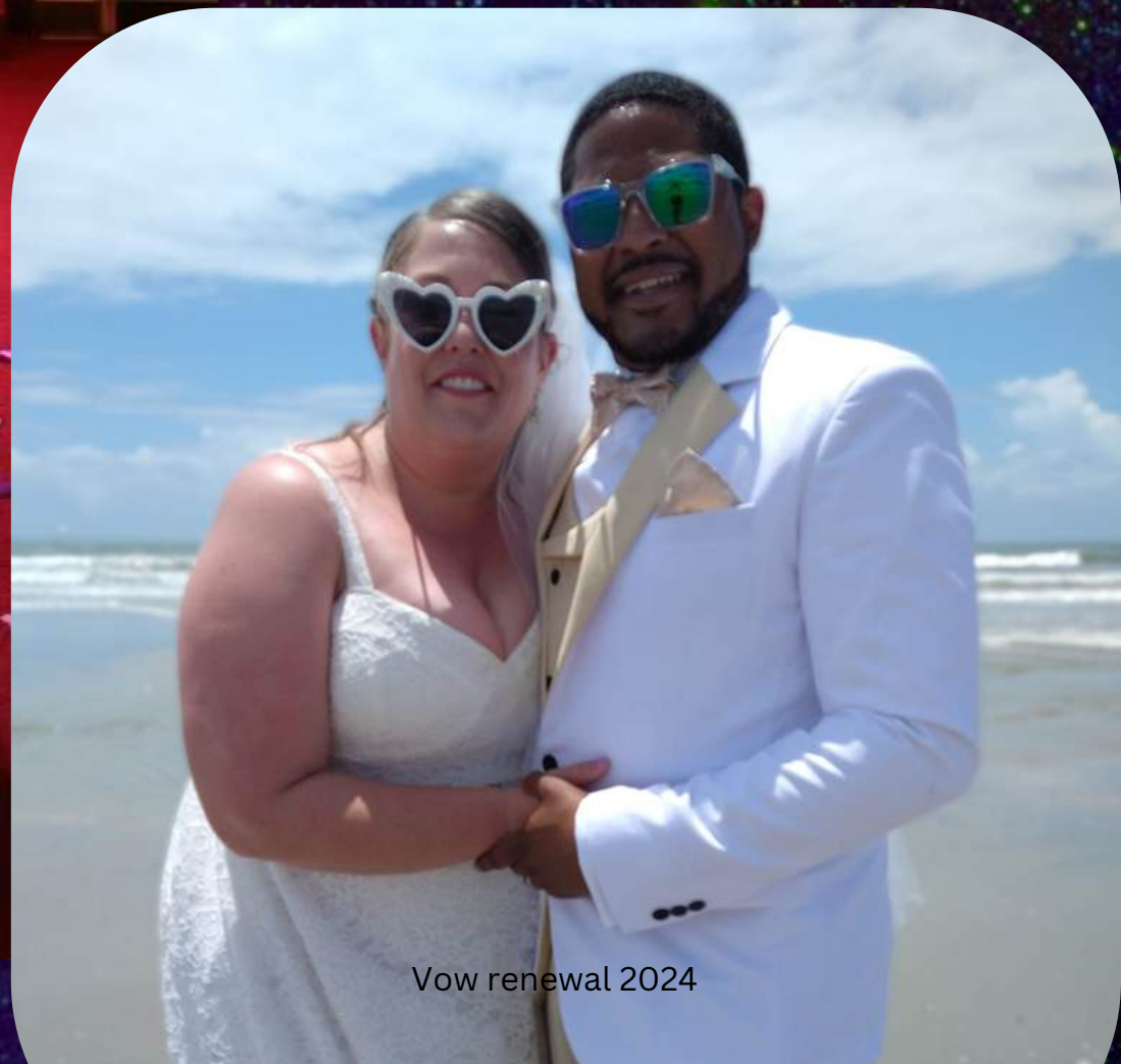
Vow renewal 2024

Together we found a town that we could call home. We bought a house, grew our circle of friends, and became deeply involved in the community. Our love for each other, our community, and our shared creative spirit has always been central to our lives. Over the years, we have enjoyed expressing our creativity in many forms, from painting to crafting in local artist groups, to music making in a community band and beyond. We love the life we have created and the community we live in.