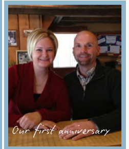
Our first anniversary