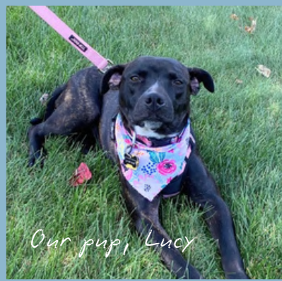
Our pup, Lucy