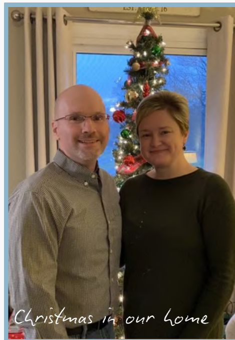
Christmas in our home