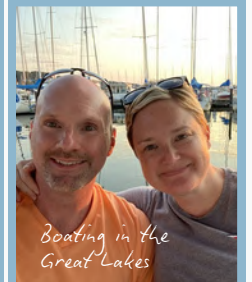
Boating in the Great Lakes