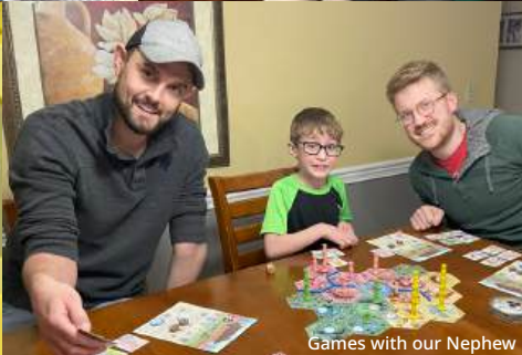
Games with our Nephew