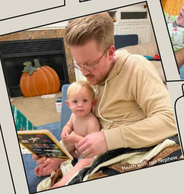
Heath with our Nephew