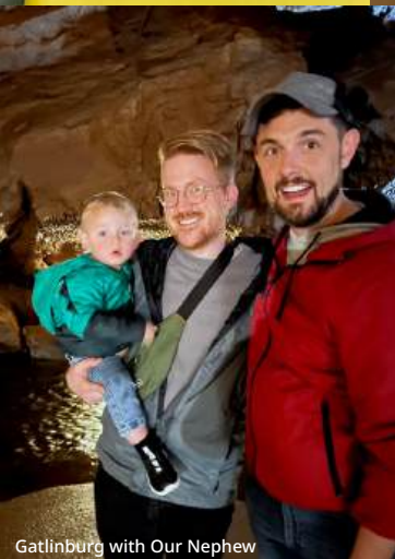
Gatlinburg with Our Nephew