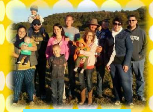
Spending Fall with Friends