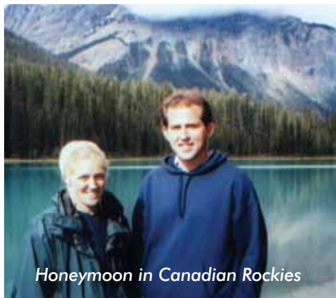
Honeymoon in Canadian Rockies