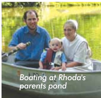
Boating at Rhoda's parents pond