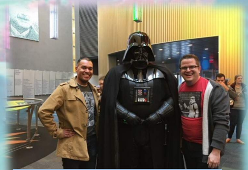
With Darth Vader