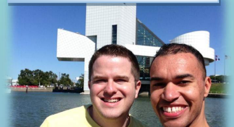
At the Rock N Roll Hall of Fame