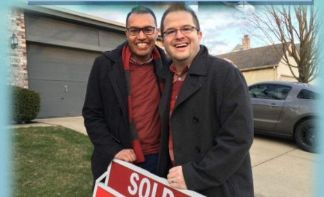
The day we bought our first home