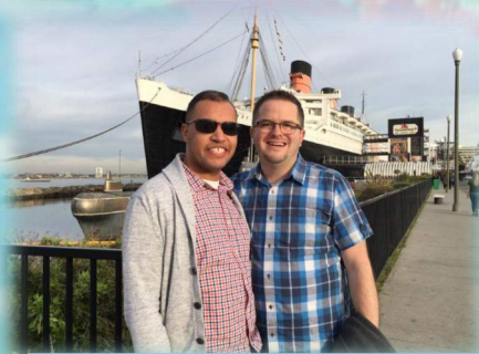
Visiting the Queen Mary