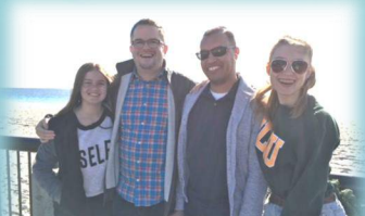
Both of our nieces in California