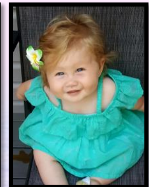
The Princess & The Angel