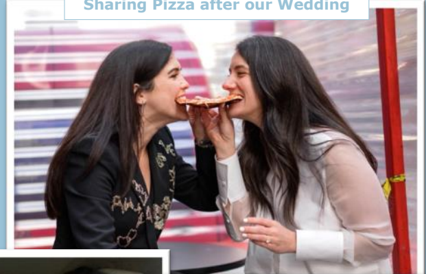
Sharing Pizza after our Wedding

We met at work while traveling every week to Westfield Center, OH. We became fast friends and found ourselves spending most evenings eating Taco Bell and talking for hours. After 3 years, we recognized the relationship had always been much more than friendship. We adopted 2 cats, eloped in NYC, and moved to Ohio with plans to start a family. We've wanted to become parents for a long time, and it was when we found each other that we knew adoption was the right path for us. We cannot wait to extend our love and the home we've made to a child.