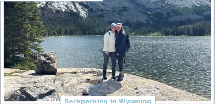
Backpacking in Wyoming