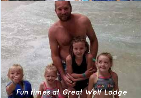
Fun times at Great Wolf Lodge