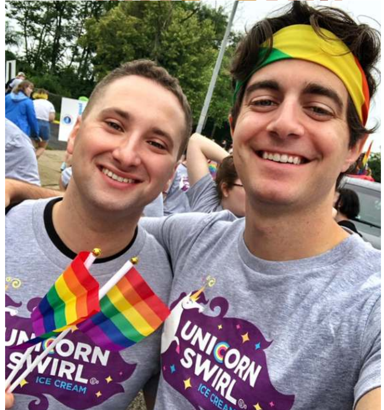
Marching in our city's annual pride parade