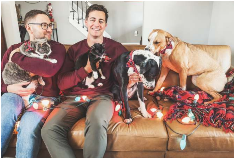
Christmas card with our pets- Hazel, Ethel, Ophelia, and Tucker