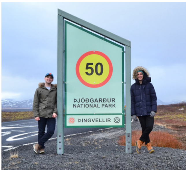
Thingvellir National Park, Iceland

We are very close to all of our families, and enjoy seeing them as regularly as possible. From holiday gatherings, vacations, dinners, or enjoying local activities, we prioritize spending time with the ones we love. We also enjoy babysitting our two-year-old niece. She keeps us on our toes and has definitely helped prepare us for parenthood.