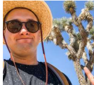
Joshua Tree National Park and our engagement