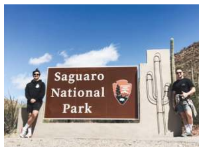
Saguaro National Park, AZ