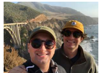
Big Sur, CA