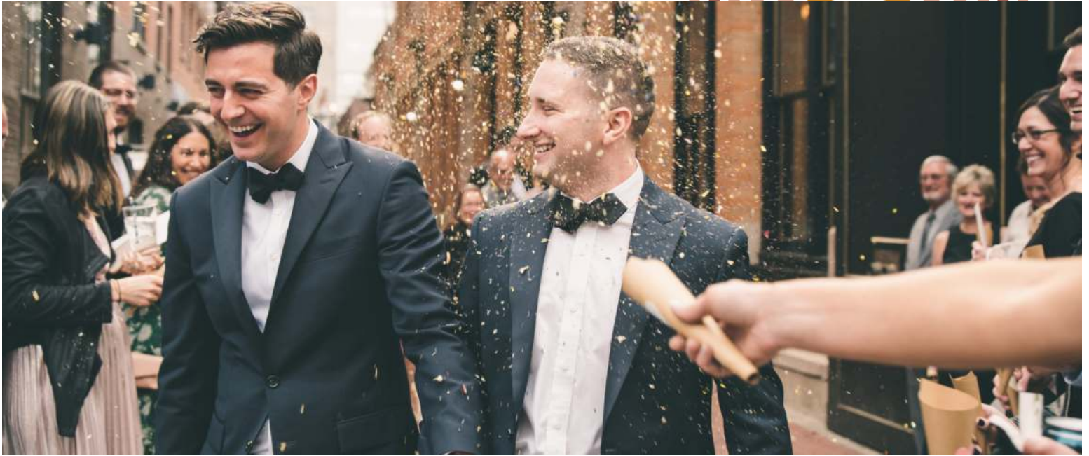
Our wedding celebration