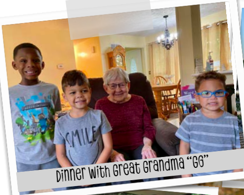
Dinner with great Grandma "Go"