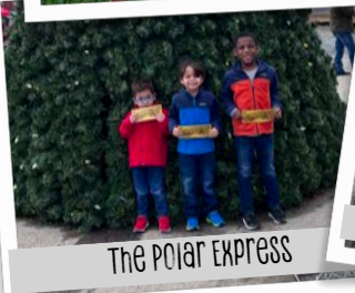
The Polar Express