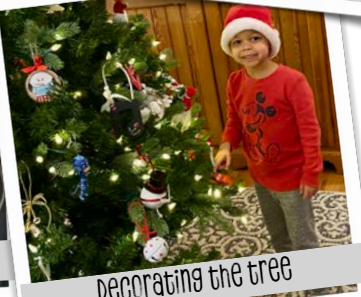
Decorating the tree