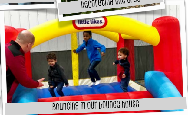
Bouncing in our bounce house