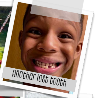
Another lost tooth