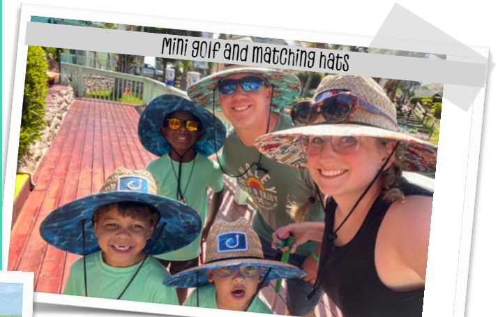
Mini golf and matching hats