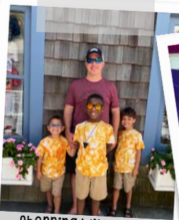
Shopping with daddy