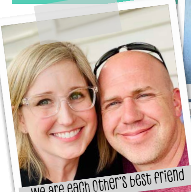
We are each other's best friend