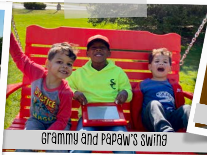
Grammy and Papaw's Swing