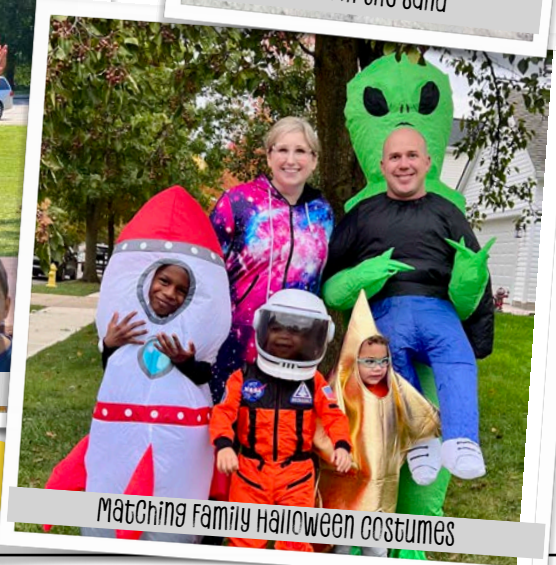
Matching Family Halloween costumes