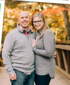
We go together like PB & J