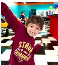
Strike a pose