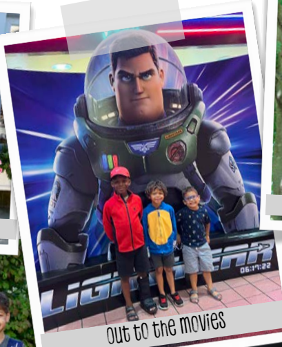
Out to the movies