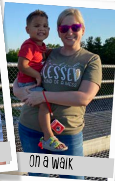
On a walk