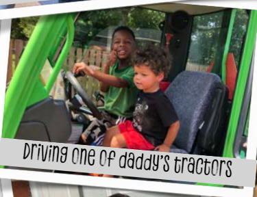
Driving one of daddy's tractors