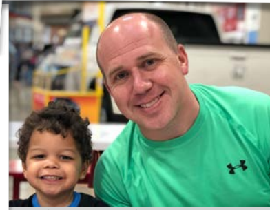
This guy loves his daddy!