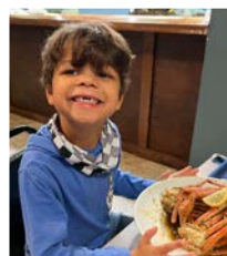
Birthday crab legs