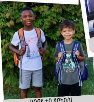
Back to school