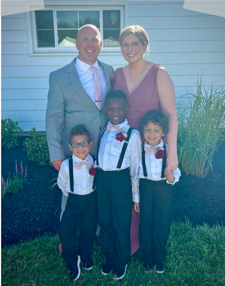
All 5 of us were in Kain's brother's wedding