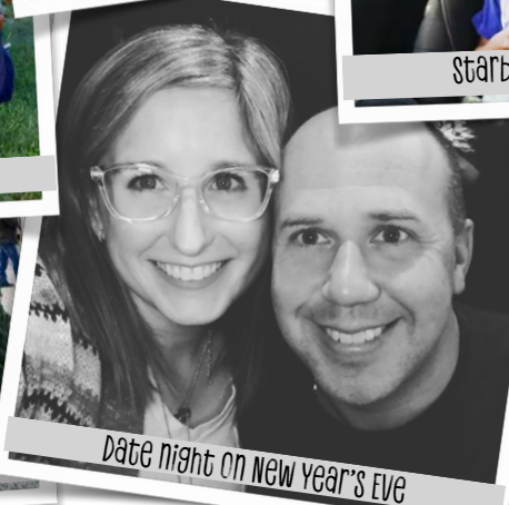
Date night on New Year's Eve