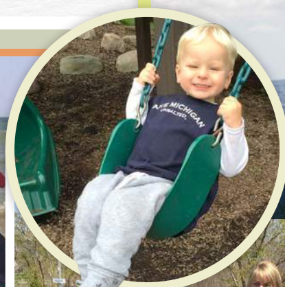
Good times at the Tulip Festival