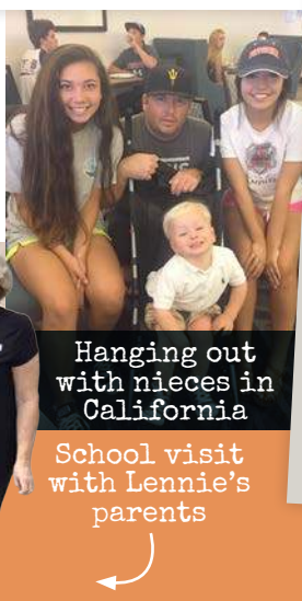
Hanging out with nieces in California