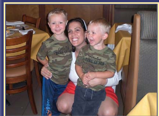
Family Brunch After Our Wedding - With Our Nephews, The Ring Bearers