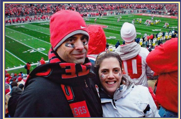
OSU vs. Michigan Football Game