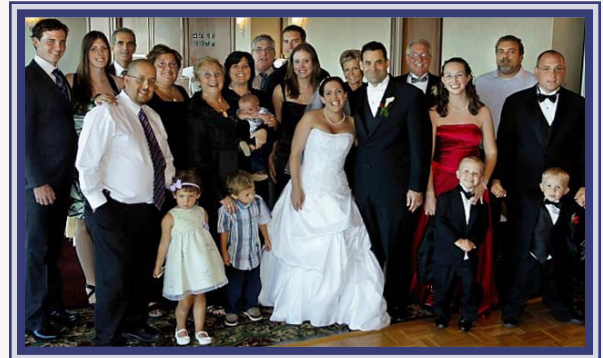
Our Wedding with Relatives