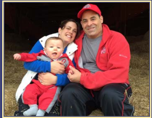
Pumpkin Patch Fun