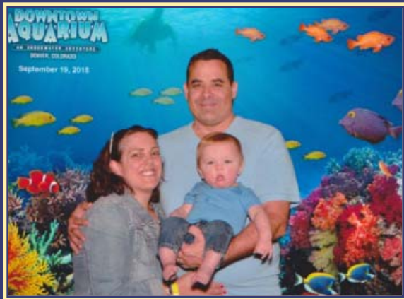
Visiting the Denver Aquarium