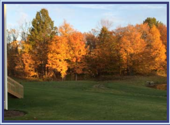
Looking Out Into Our Back Yard

We love to take care of flowers around our house from tulips in the spring to mums in the fall, but our favorite are beautiful tall rose bushes that bloom from May to November. We have so much fun decorating for fall holidays and Christmas. We could not ask for better neighbors/friends. We often have weekly cookouts with 8 families where we rotate houses each week in the summer months. The kids love Braydon and cannot wait until we have more children for them to play and help with. If something is really wrong you can count on someone within a few doors to have whatever is needed taken care before you have a chance to ask for help whether it's looking after kids, pets or house.