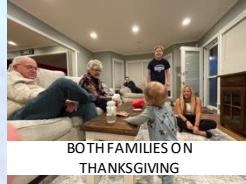
BOTH FAMILIES ON THANKSGIVING