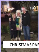
CHRISTMAS PARTY & CAROLING