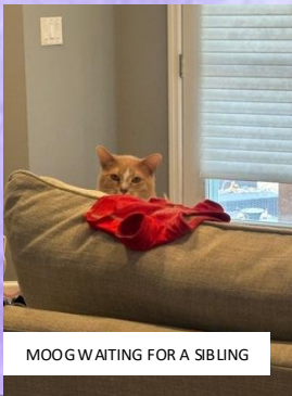
MOOG WAITING FOR A SIBLING

We look to celebrate every moment, big or small, and our home is welcoming to all, filled with love, laughter and a dash of creativity and our family is beyond thrilled to welcome new addition/s!