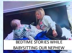
BEDTIME STORIES WHILE BABYSITTING OUR NEPHEW

We look to celebrate every moment, big or small, and our home is welcoming to all, filled with love, laughter and a dash of creativity and our family is beyond thrilled to welcome new addition/s!