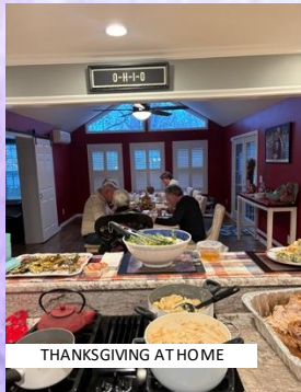
THANKSGIVING AT HOME