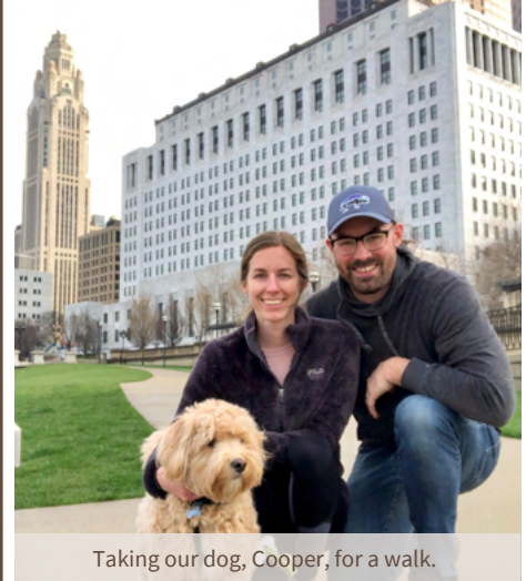
Taking our dog, Cooper, for a walk.