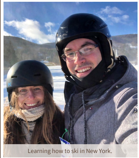
Learning how to ski in New York.