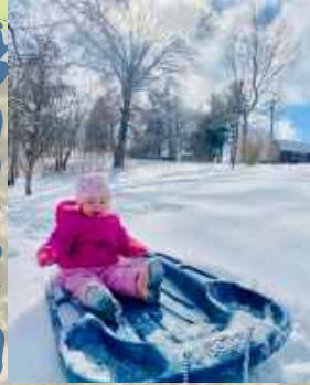
Above: Sledding in our yard Below: Toes in the sand!