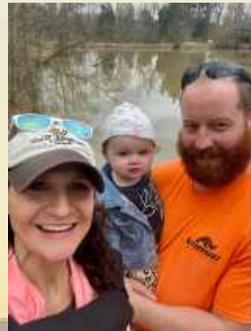
Left: Family hike at our house! This is by our neighbor's pond where we like to go fishing.