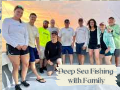
Deep Sea Fishing with Family