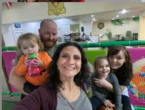
Right: Family Day with Aspen's First Mom and Big Sister