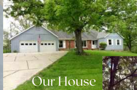
Below: The driveway to our home Below Left: Aspen running in our yard

We live just outside of the city in a ranch style home on 6 acres. It is the perfect location being minutes from the city, with the wide-open space of the country. It's the best of both worlds for us. We have 3 bedrooms and 2.5 baths. We are on the top of a hill with a lot of woods and wildlife around. We see deer, owls, squirrels, rabbits, coyotes, fox, hawks and bald eagles regularly. A little over an acre is mowed and we have a large garden as well as blackberry bushes and a pear tree. We plant a large garden every year and can our own fruits and veggies and are always working on a home improvement project. We have a big concrete deck surrounding our pool that we love enjoying with family and friends.