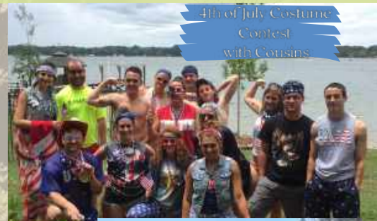
4th of July Costume Contest with Cousins