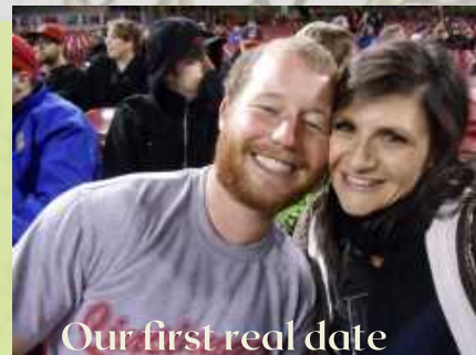
Our first real date