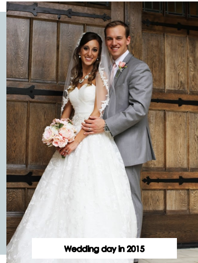
Wedding day in 2015

We are very fortunate to work for companies with flexible time off and work-from-home options that would allow us to prioritize our family.