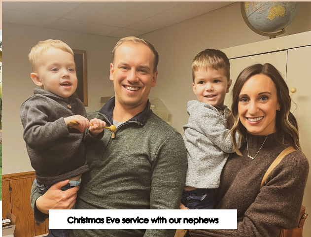
Christmas Eve service with our nephews