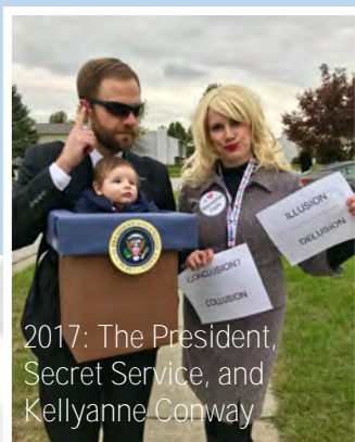
2017: The President, Secret Service, and Kellyanne Conway