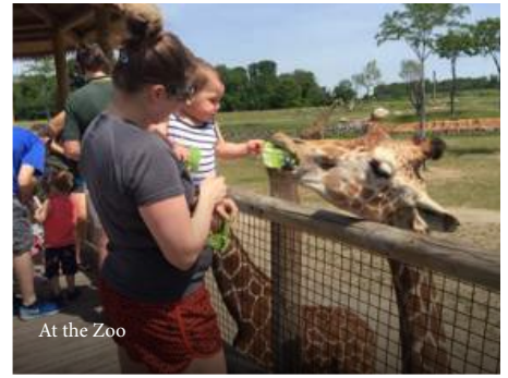
At the Zoo