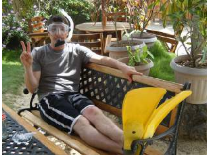
Getting prepared for snorkeling

Once I finished at CCAD, I made a living being contracted to paint murals and canvas paintings. Artwork is now more of a hobby. Seven years ago I started my own business as