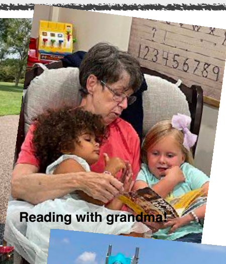
Reading with grandma