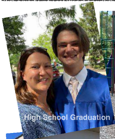
High School Graduation

We live a life of constant adaptation, but it is ever filled with kindness, love and careful attention. We seek to remain proactive towards new challenges, yet we understand that raising a family is a constantly rewarding work-in-process. It's been our experience that unconditional love, mutual support, and the grace of God are the ties that bind us and carry us through. We cherish the little things and hope that's evident in how we lead our lives together.