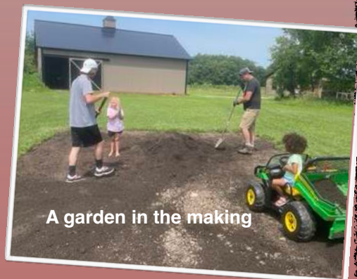
A garden in the making

We love cutting down our own Christmas tree and getting hot chocolate in the cabin afterwards. It's our favorite time to decorate using old family ornaments that have been passed down over the years. And we have multiple chances to celebrate Thanksgiving or Easter dinners over the course of several days with all of our families.