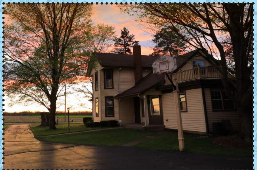
Our home in the country.

Our family enjoys visiting, to absorb this calming environment. It has become a fun gathering place for our loved ones, because we have spectacular views and open space.