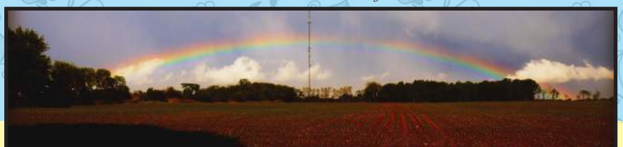
View from our backyard.