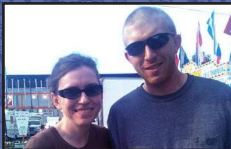
Spending time at the county fair.