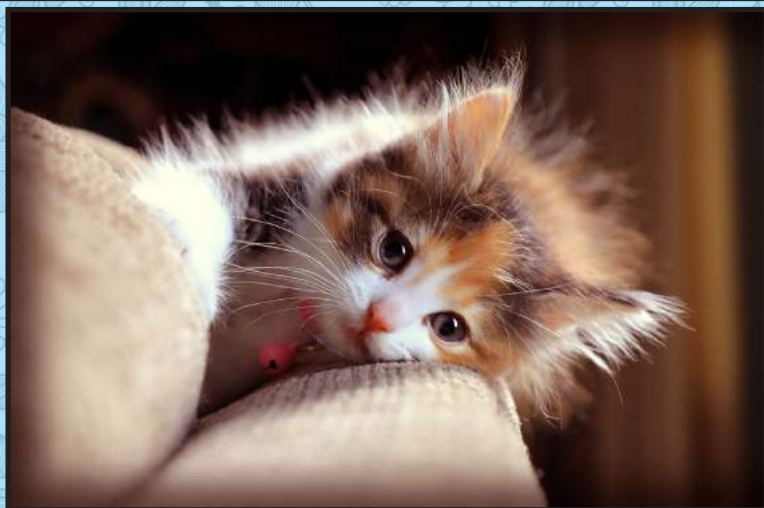
Gracie at home.