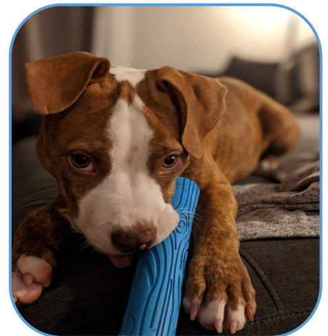
Our dog, Bodhi