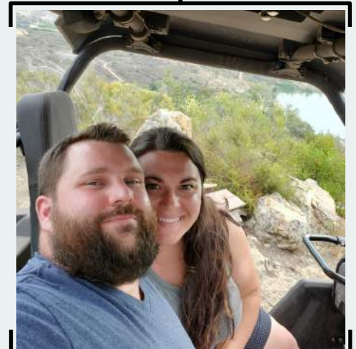
Trail riding in California