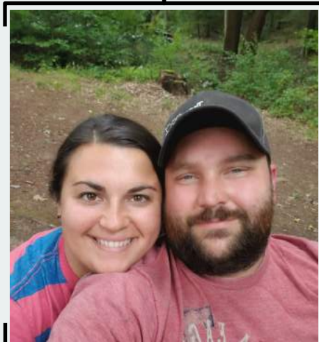
Weekend camping trip

We love spending time outdoors, from kayaking and camping, to gardening and picnicking!