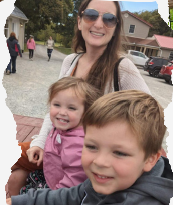
APPLE PICKING WITH MY NIECE AND NEPHEW

My dad and I like to go for walks with my parents' dog -- Bodie. He also likes to give me tips on yardwork and planting flowers. He is enormously helpful with fixing things!