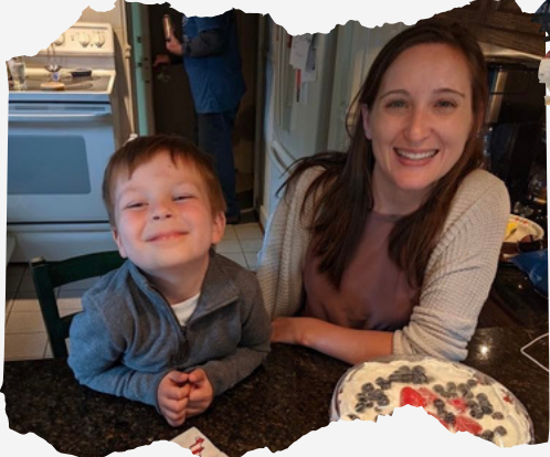
4TH OF JULY WITH A DELICIOUS "TRIFLE" MADE BY MY MOM -- A TRADITION!