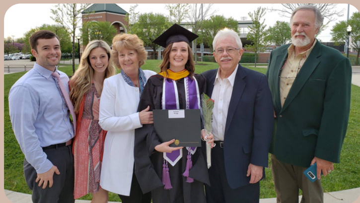
CELEBRATING MY GRADUATION WITH MY FAMILY!

My brother understands me in a way only siblings can! We bond over the same joys we had as children -- usually movies or shows that we now share with my niece and nephew.