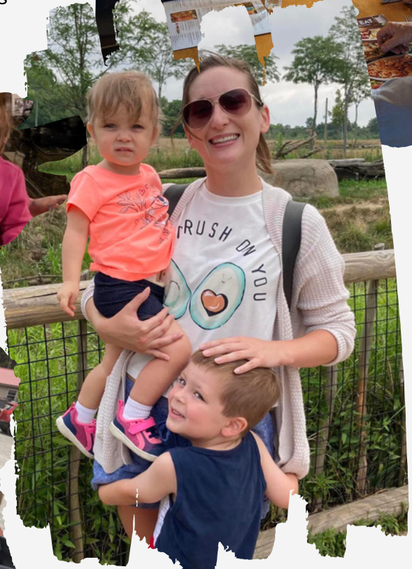
AT THE ZOO!