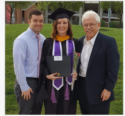
MY DAD, BROTHER AND MYSELF AT MY GRADUATION - WE ARE ALL OSU GRADS!

I work 8am to 4pm -- no weekends or holidays!