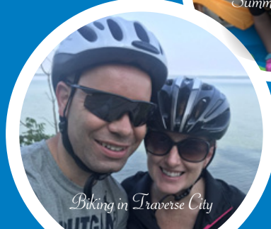
Biking in Traverse City