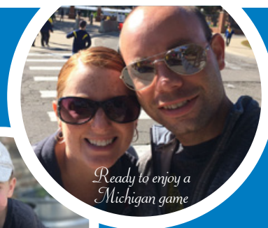
Ready to enjoy a Michigan game