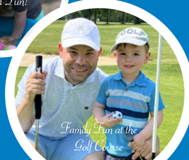
Family Fun at the Golf Course