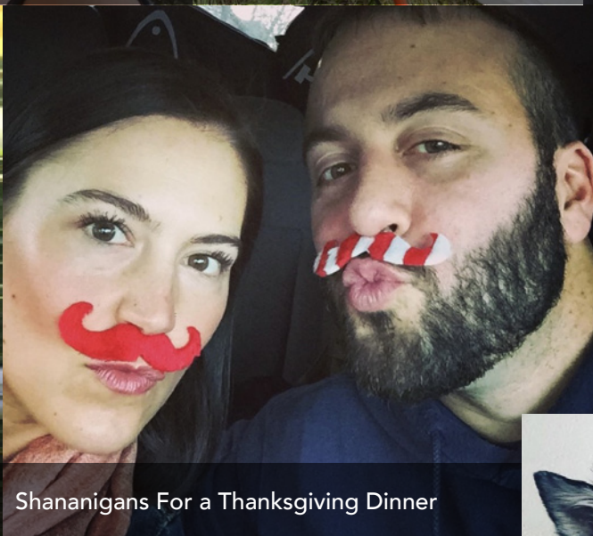
Shananigans For a Thanksgiving Dinner