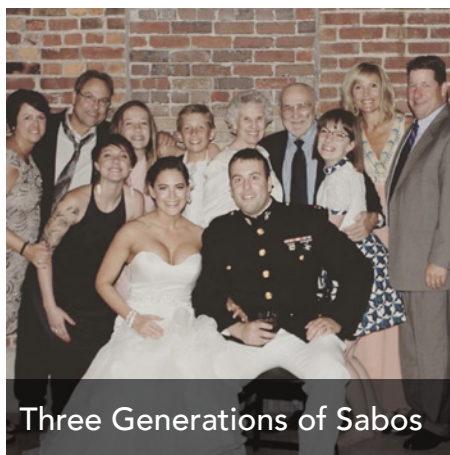
Three Generations of Sabos